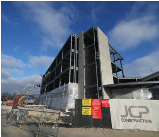
Outreach Community Health Center's new Capitol Drive clinic under construction in 2023. JCP, one of the Foundation's impact investing loan recipients, was the general contractor on the project.

368 jobs have been created or retained through the Foundation's impact investing program.