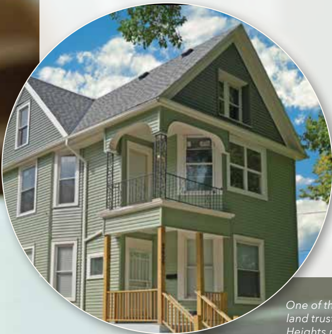
One of the homes sold by the land trust in Milwaukee's Lindsay Heights neighborhood.