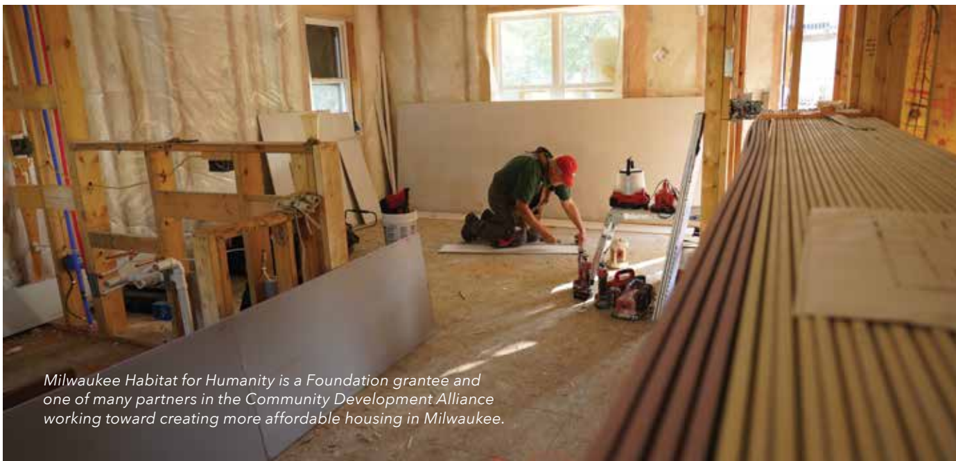
Milwaukee Habitat for Humanity is a Foundation grantee and one of many partners in the Community Development Alliance working toward creating more affordable housing in Milwaukee.